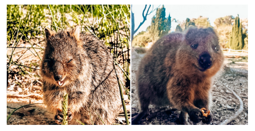
Quokkas use the front paws to search for and pick up food and this is the best moment to take a photo of them. Because it is when they're eating it looks like they're smiling!